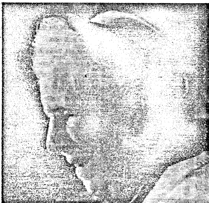
TIRELESS PIONEER ... Constance Applebee