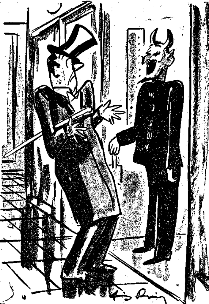
Reprinted from the December issue of Esquire.