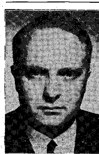
Robert Casadesus, celebrated French pianist-composer, will play tomorrow night in Phi Beta Kappa Hall.

"I would walk a mile to hear him play practically anything at any time," wrote Virgil Thompson, critic of the New York Herald Tribune , recently, speaking of the world-famous French pianist, Robert Casadesus. Casadesus is scheduled to appear in Phi Beta Kappa Hall on Thursday, January 11.